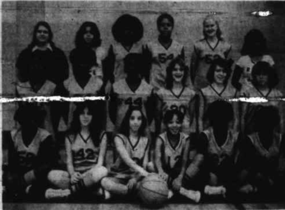
Eagle Lake Middle School eighth grade girls basketball team will conclude their season this Thursday and Friday in the District 20AA girls Jr. High School basketball tournament to be held in Columbus.